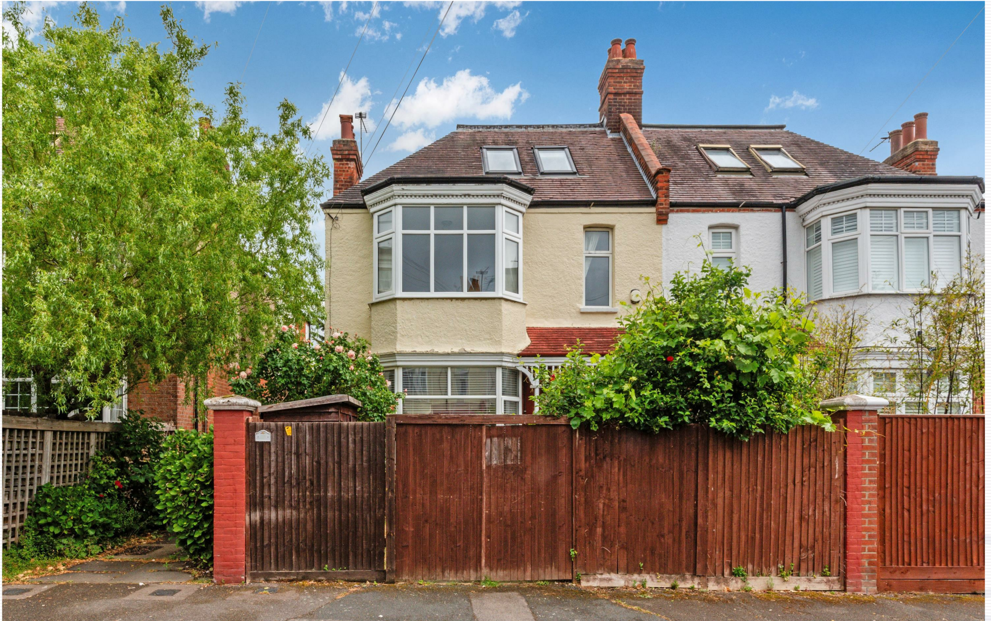
Laurel Road, West Wimbledon, SW20 0PR